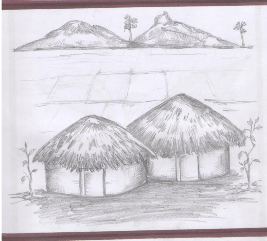
Vellore District-Eco competitions