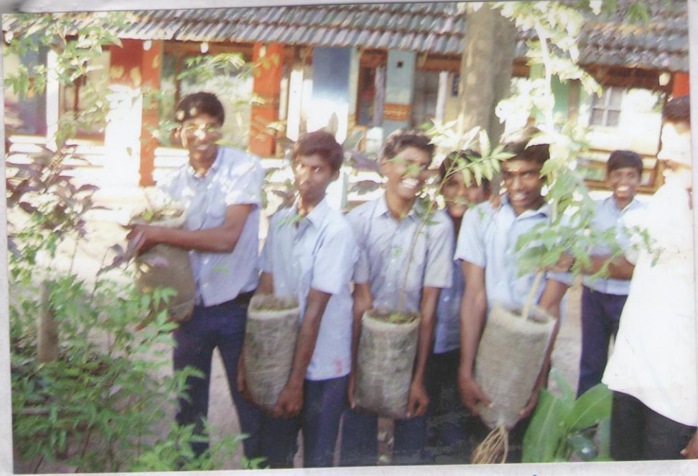
பெரியகல்வெட்டுவாசல் பெரியகல்வெட்டுவாசல் ,