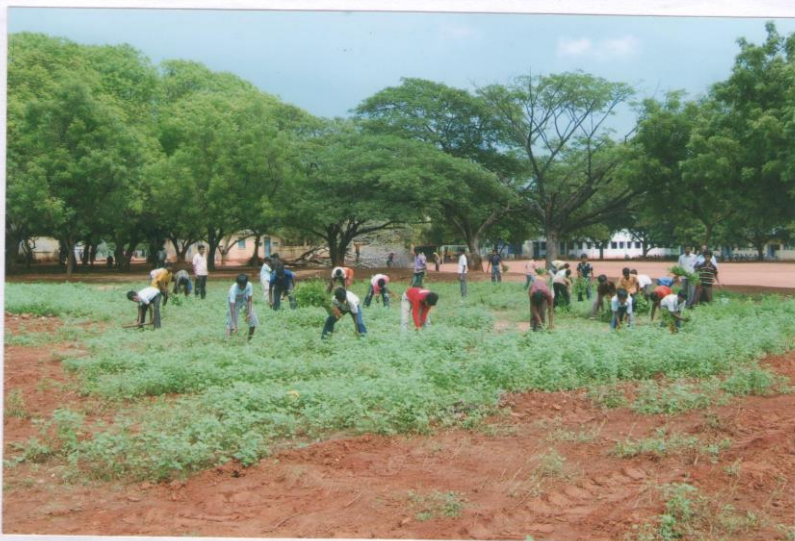
உதாரண சூரிய ஆற்றல்