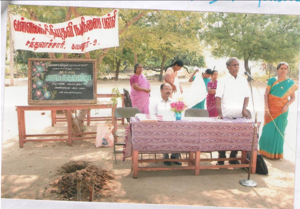
மாநாடு நடுவிலே அமர்ச்சி .