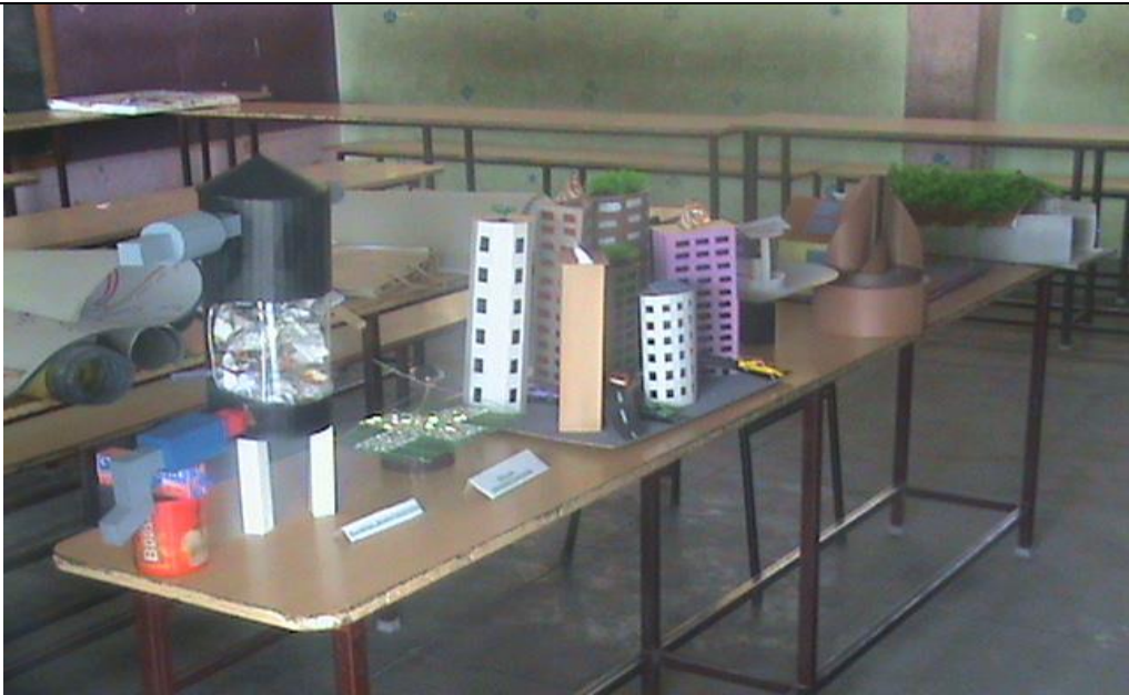
Salem District-Enviro expo