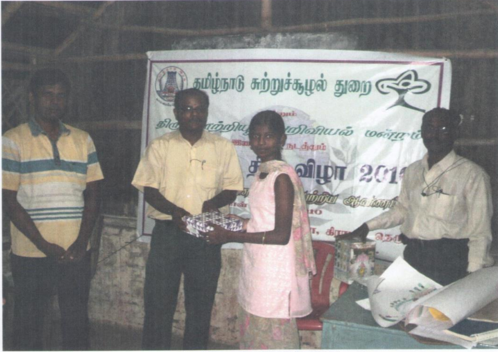
Another Winner from Earth Day 2010