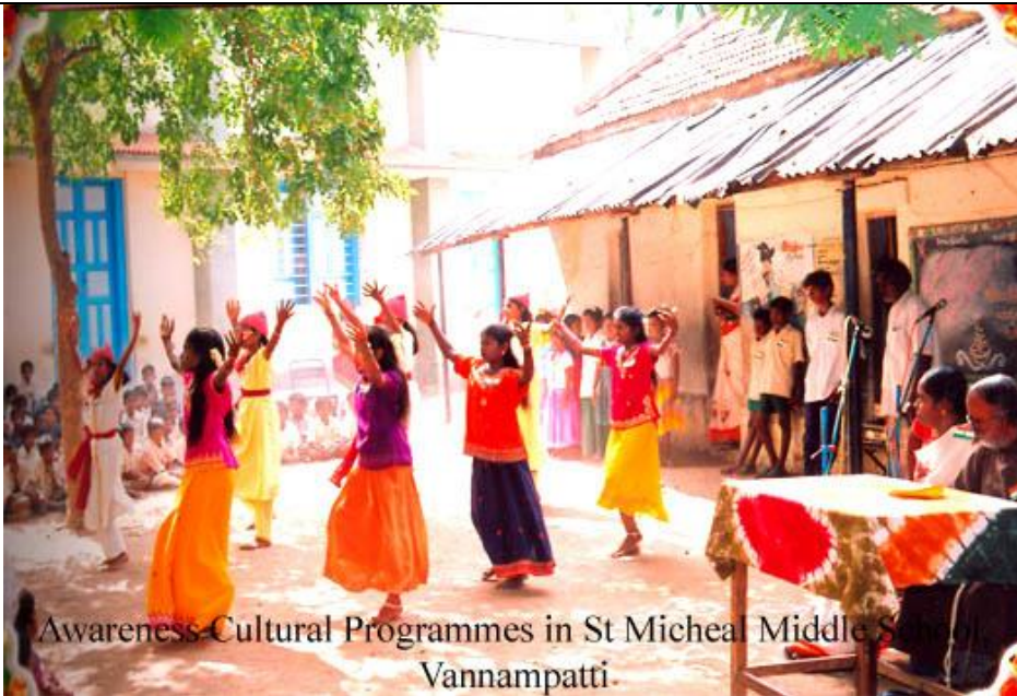
Awareness Cultural Programmes in St Micheal Middle S Vannampatti.